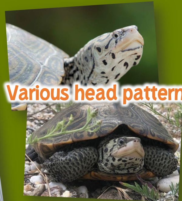
Various head patterns