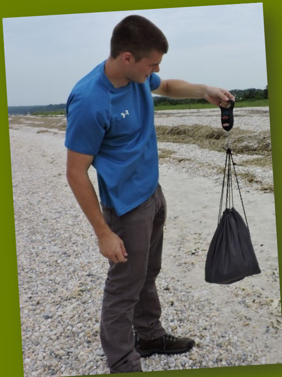
Weigh using a bag and scale