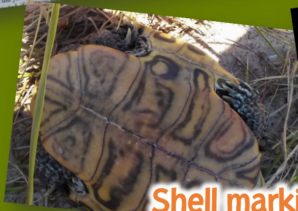
Shell marking (i.e., notches, patterns, peeling, scars)