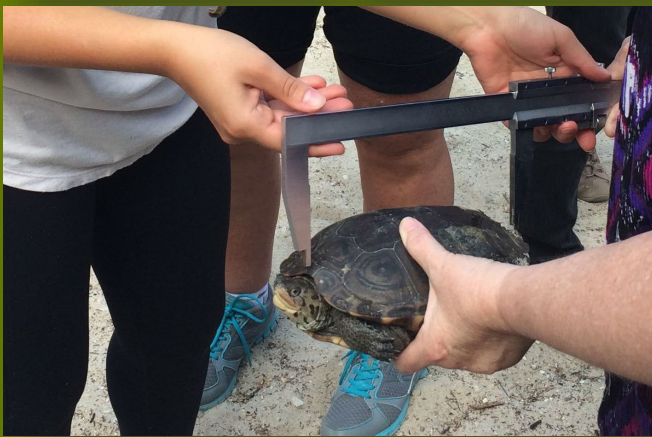
Measure with a caliper